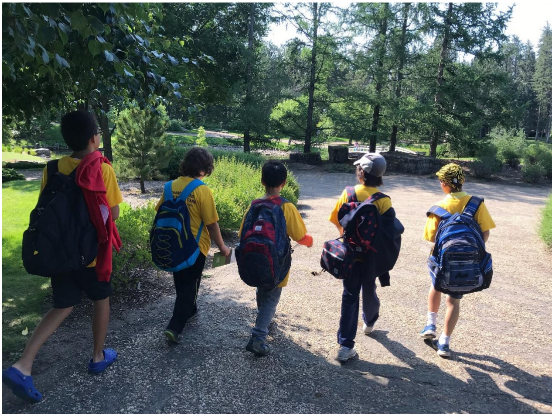
Top Photo: Children at the Edmonton Valley Zoo/ Bottom Photo: Children at the U of A Botanical Gardens